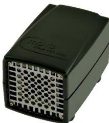
Hand Warmer (P012-62)